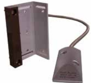
Heavy Duty Magnetic Reed Door Switch