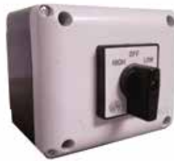
Remote Selector Switch