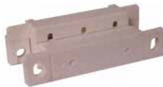
Magnetic Reed Door Switch