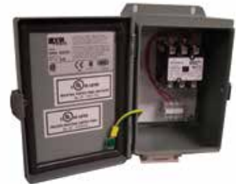
Motor Control Panel