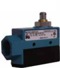
Plunger Style Door Switch