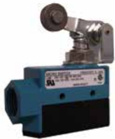
Roller Style Door Switch