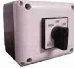
Remote Selector Switch