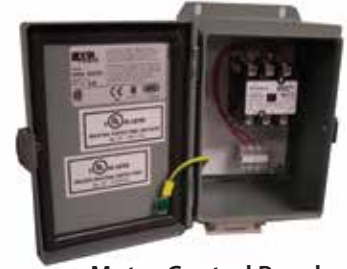
Motor Control Panel

MORE QUALITY PRODUCTS available from BERNER INTERNATIONAL