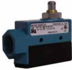
Plunger Style Door Switch