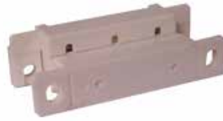
Magnetic Reed Door Switch