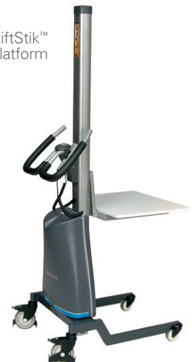
LiftStik™ With Platform