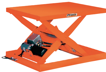
XS Series Light Duty Scissor Lifts