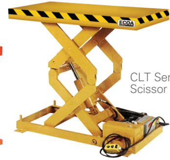
CLT Series Double Scissor Lifts