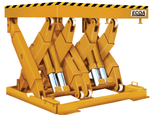
MLTDL Double-Long Series