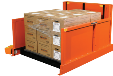
P4™ Roll-On Pallet Positioner