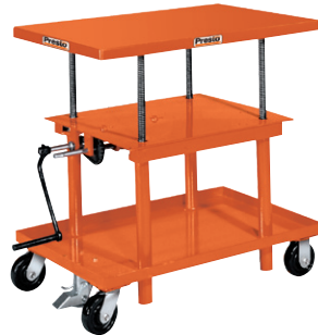
Mechanical Post Lift

Post lift tables are available in a variety of configurations including two-post, four-post, and cantilever. Choose 1,000, 2,000, or 3,000 lb. capacity units with platform sizes from 20" x 30" up to 30" x 60". Lifting and lowering options include mechanical hand crank, foot pump actuated and electrohydraulic.