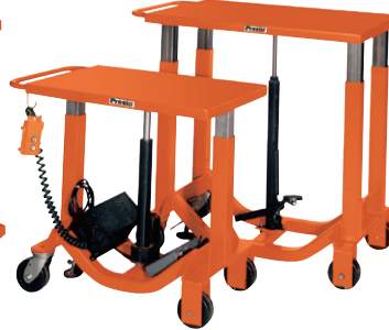
Hydraulic Post Lift