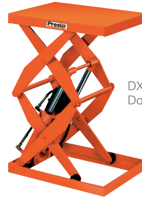
DXS Series Double Scissor Lifts