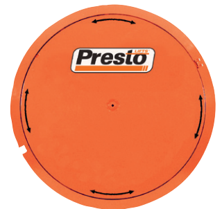
Low Profile Turntable