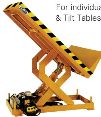
CLTLT Series SpaceSaver Lift & Tilt Tables

Fixed Height Tilters are also available and can be mounted on legs, work benches, or directly to the floor.