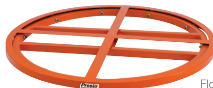
Floor Mount Turntable Ring