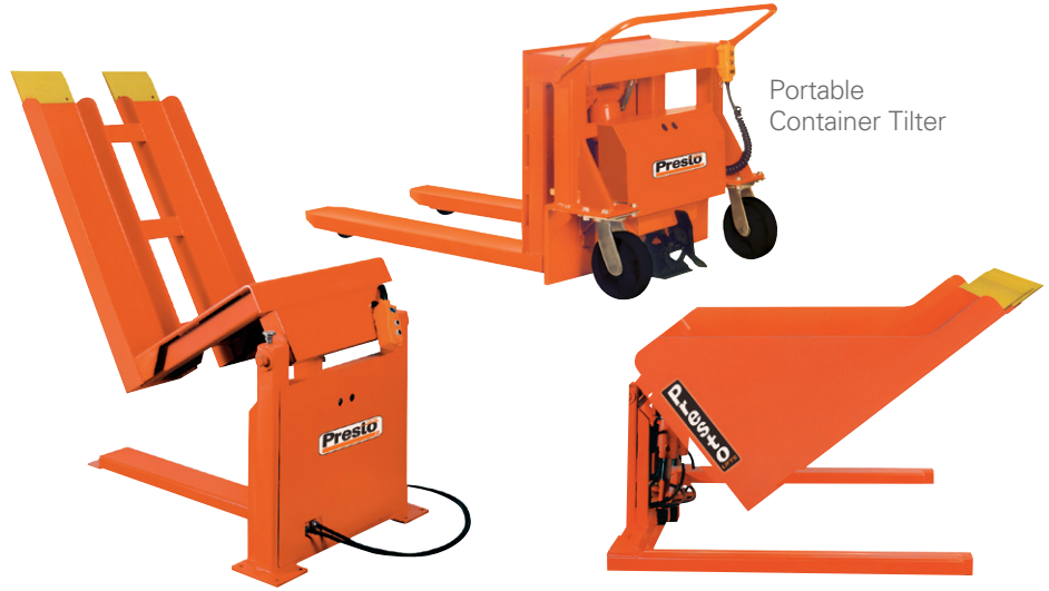
Stationary Container Tilter

Floor Level units work with any style of container and can also be fed by a hand pallet truck.