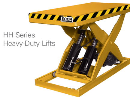
HH Series Heavy-Duty Lifts