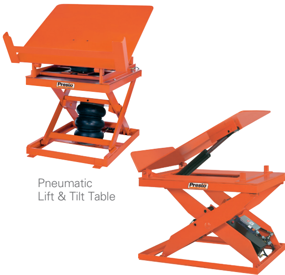
Pneumatic Lift & Tilt Table