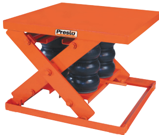
Pneumatic Scissor Lift