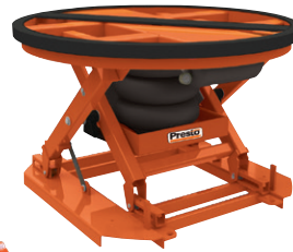
P3™ All-Around Pneumatic Load Leveler