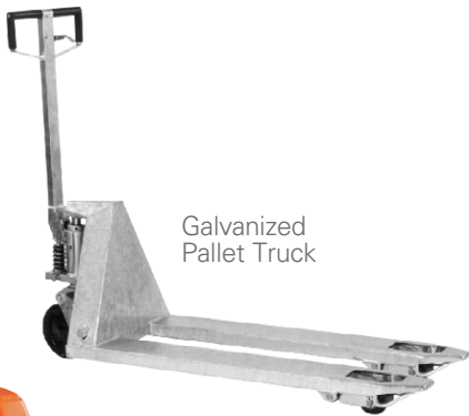
Galvanized Pallet Truck