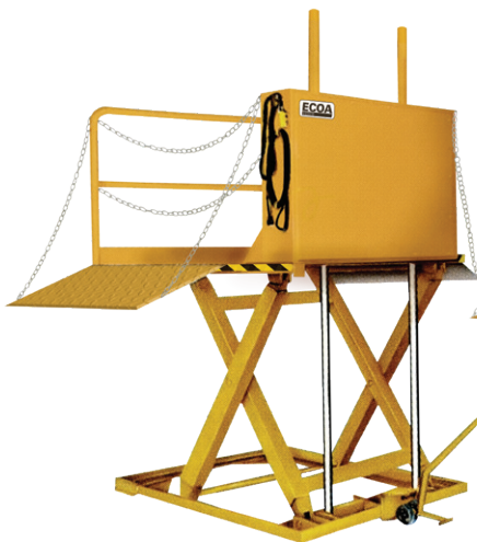
Trans-A-Dock TAD Series Surface Mount Loading Dock Lifts