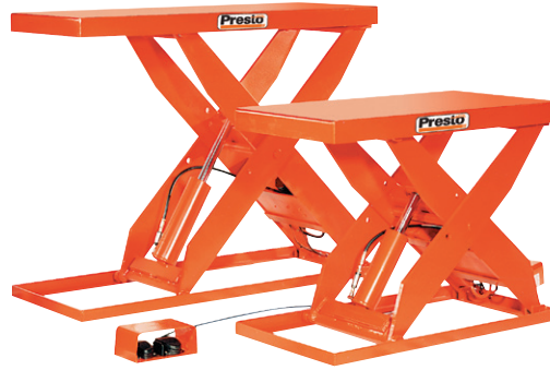
XL Series Standard Duty Scissor Lifts

Presto ECOA Lifts offers a full line of Hydraulic Scissor Lift Tables with capacities up to 12,000 lbs., available in: Light Duty; Standard Duty; Heavy Duty; and Compact, Double High configurations. They position material at just the right level to eliminate bending, stretching, and reaching.