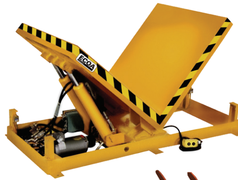
HUE Series Upenders

UT90 Series Upenders are available with platens or forks as well as optional v-cradle platforms.