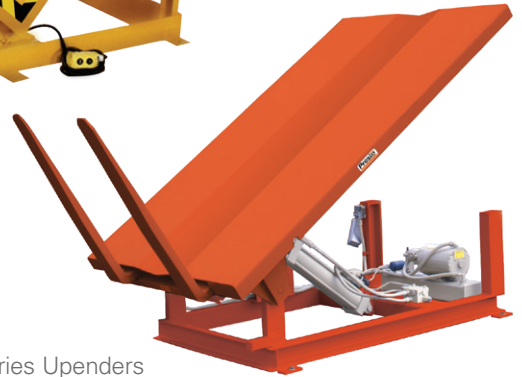
UT90 Series Upenders