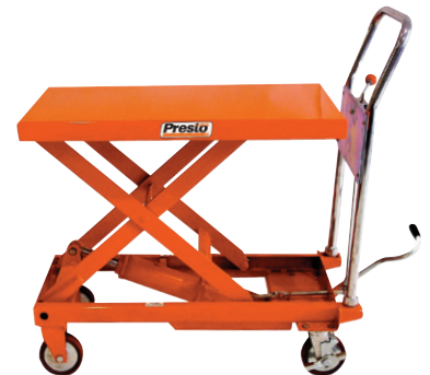
XP Series Portable Manual Scissor Lift