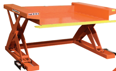
Floor Level Lift