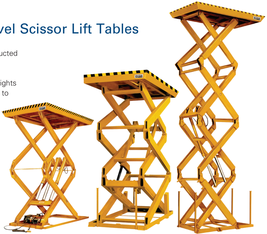
DSL Series Double Scissor Lift Tables

These high-travel double, triple, and quad scissor lift tables are designed and constructed for heavy-duty applications that require extended vertical travel. Multiple scissor mechanisms allow for maximum lifting heights in a small footprint. Capacities from 2,000 to 6,000 lbs. are available with lift heights from 70" up to 356".