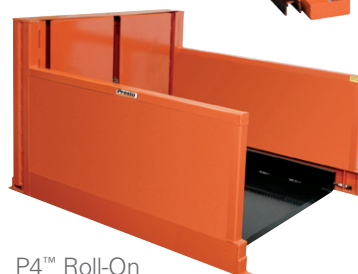
P4™ Roll-On Pallet Positioner