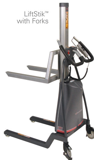
LiftStik™ with Forks