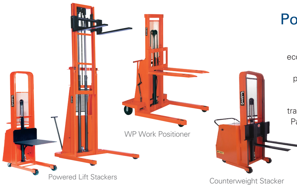
Powered Lift Stackers

For light to medium-duty usage, Powered Lift Stackers offer an economical alternative to forklift trucks. Units can be equipped with forks or platforms and are available in straddle or counterweight designs. The WP Work Positioner is ideal for lifting, transporting and assembly applications. Pallet Stackers can service racks up to 12' high with loads up to 3,000 lbs.