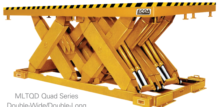
MLTQD Quad Series Double-Wide/Double-Long