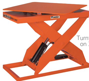
Turntable Mounted on XL Series Lift

Standard turntables can be mounted to the floor, to a fixed height stand, or to a lift table.