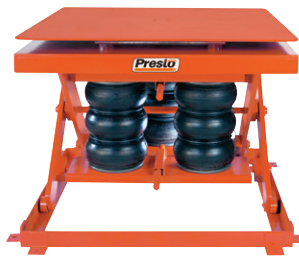
Pneumatic Scissor Lift & Rotate