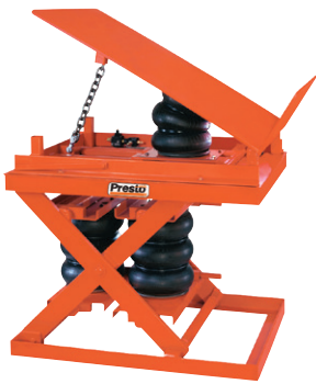
Pneumatic Scissor Lift & Tilt