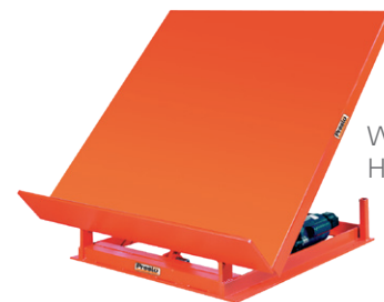
Wide Base Fixed Height Tilter