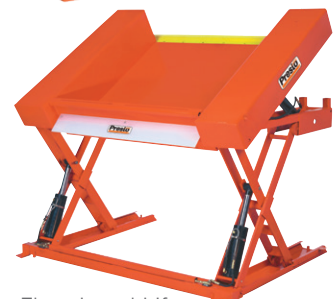
Floor Level Lift & Tilt Table