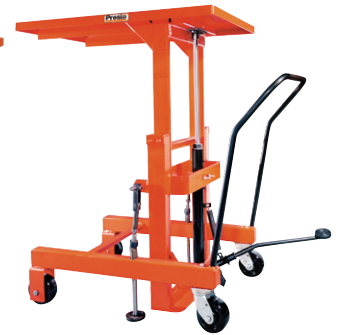
Hydraulic Cantilever Lift