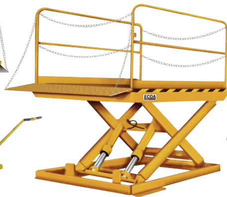
SizzrDok HLD Series Dock Lifts