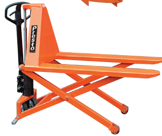
Manual Skid Lifter