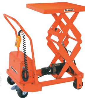
DBP Series Portable Double Scissor Lift