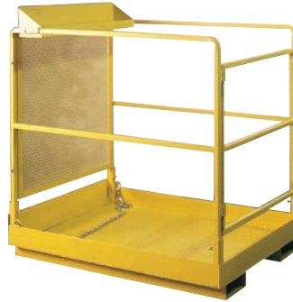
Swing gate type shown with optional tool tray