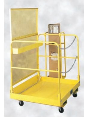
Model FWP44 shown with optional light bulb caddy, riser, tool tray and casters