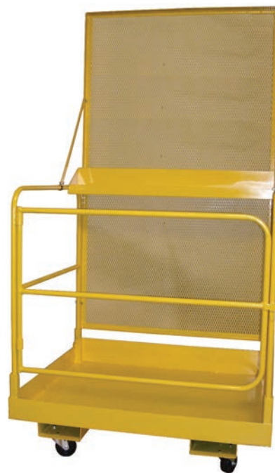
Shown with optional cal-OSHA riser