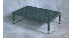
Adjustable 1- Step Platform Model W1N23-9