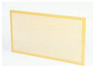
24" Screen Riser