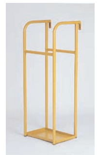
Light Bulb Caddy