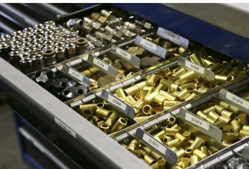
Wide range of dividers and partitions