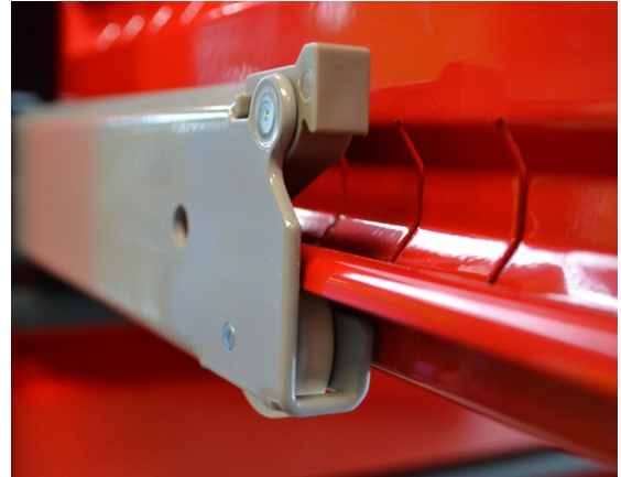
27 Series - load capacity of 200 or 440 lb