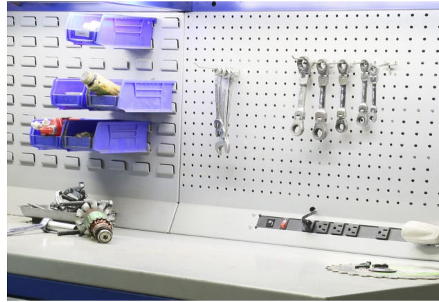
Louvered, plain or perforated back panels