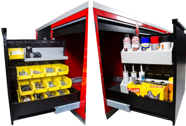
Louvered panel drawers