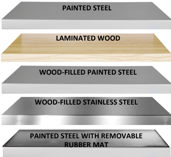
Choice of work surfaces