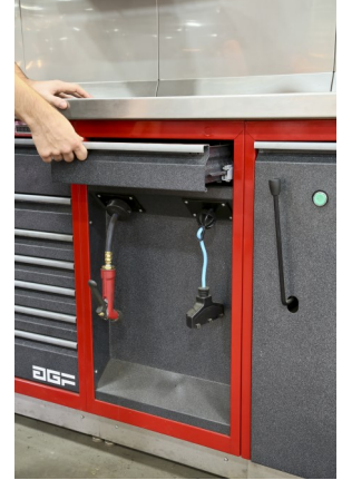
Air and fluid roller reels