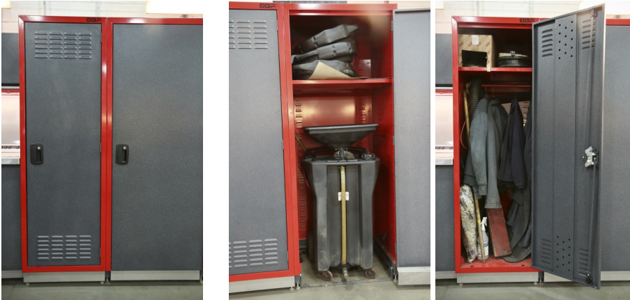
A full range of storage cabinets with optional ventilated doors