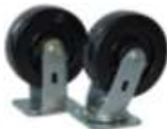
404010 & 404009