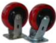
404060 & 404059