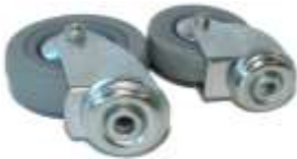
402024 et 401006