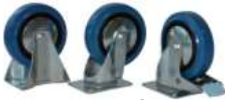
403006, 403004 & 403005