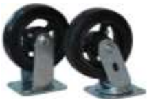
404007 & 404006