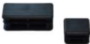
421012 & 421007